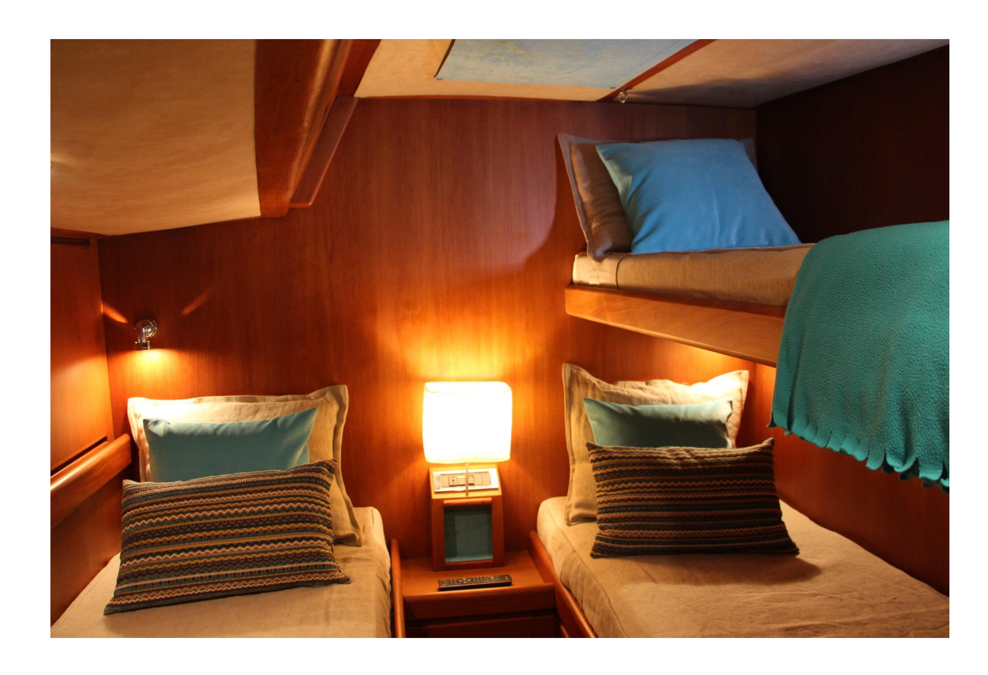
Sailing Yacht WALLY ONE