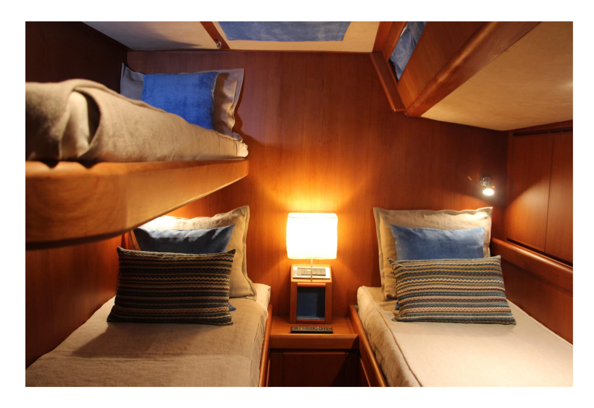
Sailing Yacht WALLY ONE