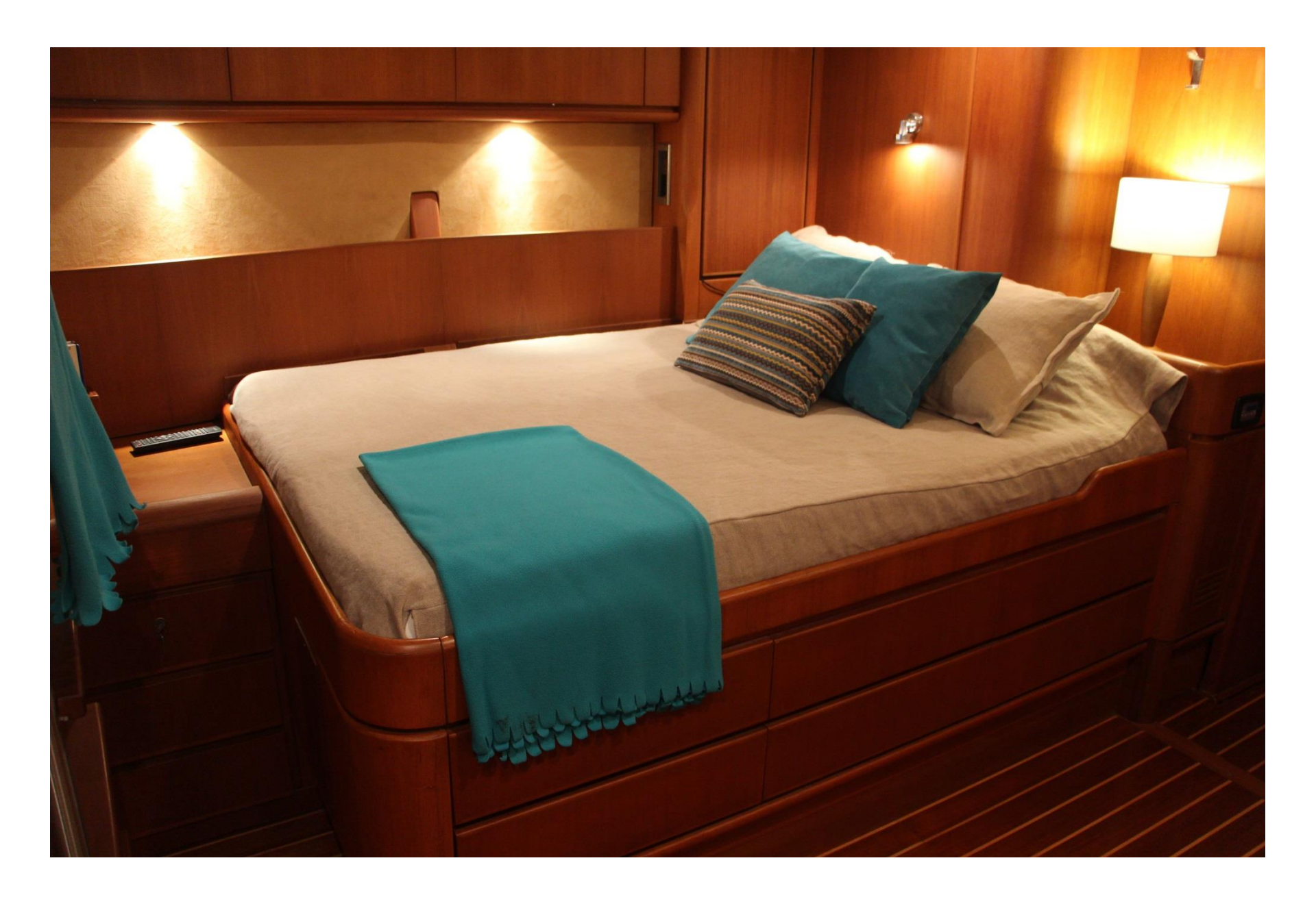
Sailing Yacht WALLY ONE