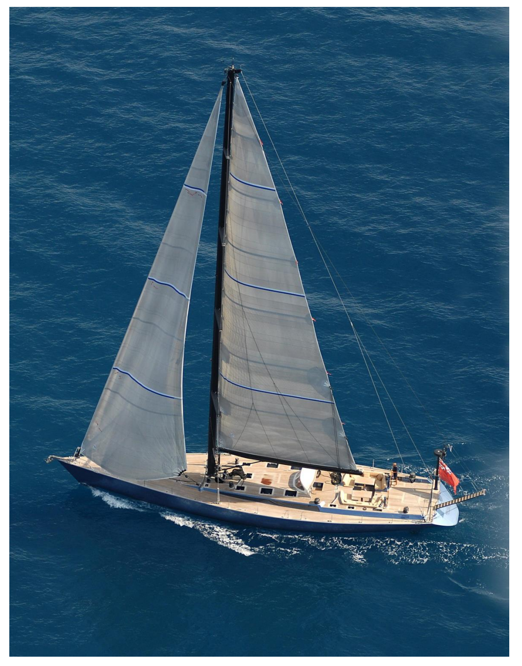
Sailing Yacht WALLY ONE