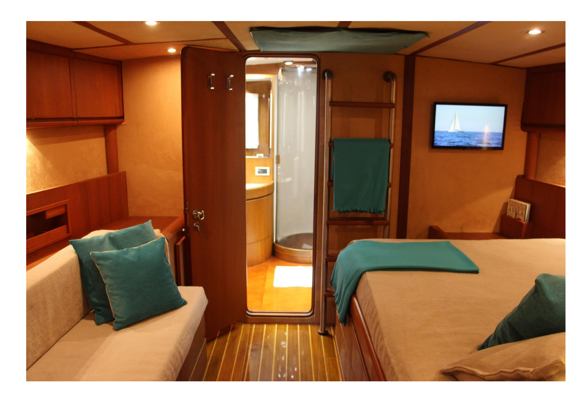
Sailing Yacht WALLY ONE