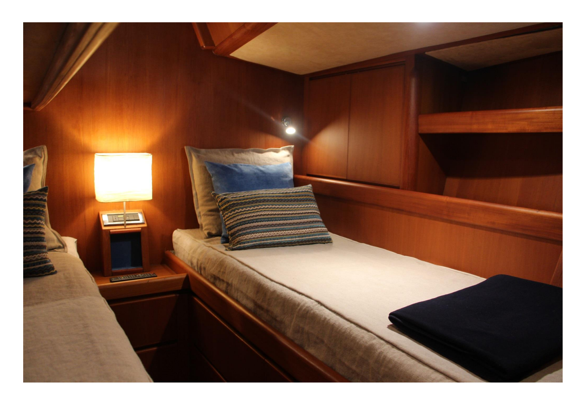
Sailing Yacht WALLY ONE