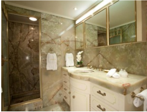
Master Stateroom - Ensuite