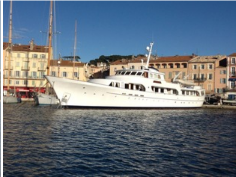
Winter Berth - St Tropez