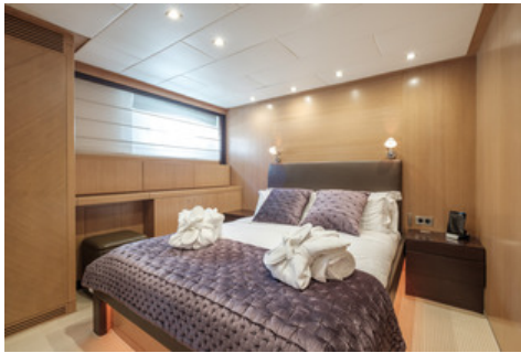
Midnight Sun - Double Cabin