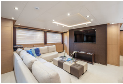
Midnight Sun - Main Saloon