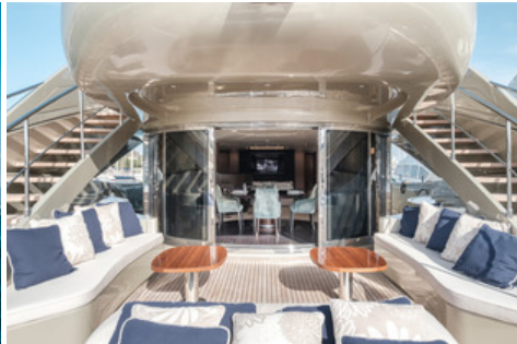
Midnight Sun - Aft Deck