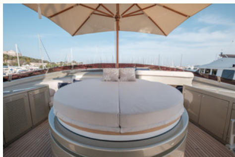
Midnight Sun - Flybridge Jacuzzi