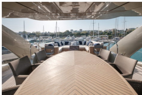
Midnight Sun - Flybridge Formal Dining