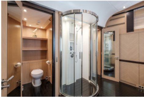
Midnight Sun - Master Ensuite