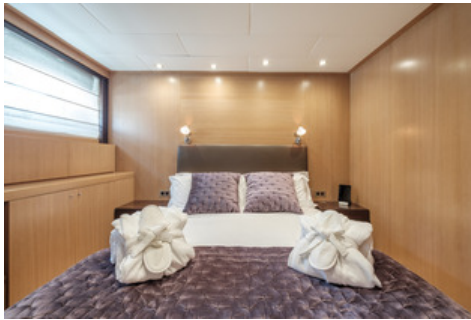
Midnight Sun - Double Cabin