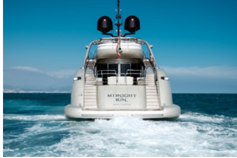
Midnight Sun - Aft Profile

Her well-appointed, spacious deck areas are designed for maximum flexibility, adaptable to every situation from private sunbathing to elegant cocktail parties. A refreshing Jacuzzi for the sun lovers completes the expansive deck facilities and the AV systems controlled via Ipads finish off this truly spectacular yacht - a superb platform for a luxurious charter vacation.