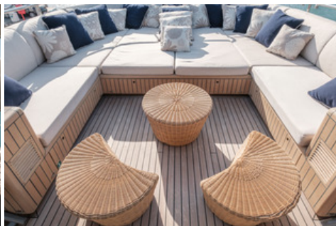
Midnight Sun - Flybridge Sunpads