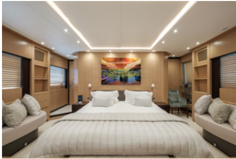
Midnight Sun - Master Cabin