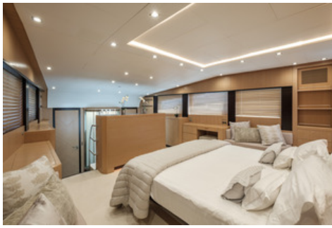
Midnight Sun - Master Cabin