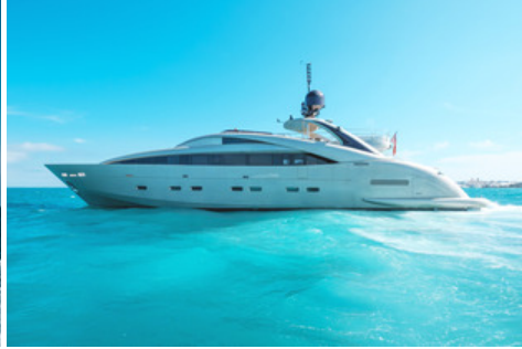
Midnight Sun - Profile