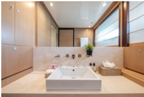
Midnight Sun - Ensuite

This document is not contractual. All specifications are given in good faith and offered for informational purposes only. The publisher and company do not warrant or assume any legal liability or responsibility for the accuracy, completeness, or usefulness of any information and/or images displayed. Yacht inventory, specifications and charter prices are subject to change without prior notice. None of the text and/or images used in this brochure may be reproduced without written consent from the publisher.