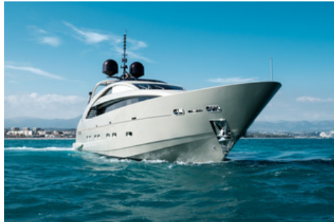
Midnight Sun - Running Profile