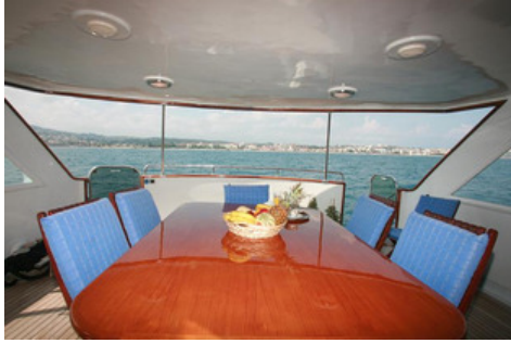
Aft deck view 2