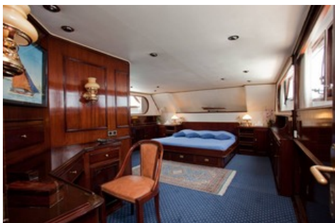
Master Cabin Office