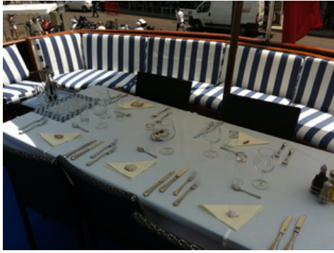
Flybridge dining area

This document is not contractual. All specifications are given in good faith and offered for informational purposes only. The publisher and company do not warrant or assume any legal liability or responsibility for the accuracy, completeness, or usefulness of any information and/or images displayed. Yacht inventory, specifications and charter prices are subject to change without prior notice. None of the text and/or images used in this brochure may be reproduced without written consent from the publisher.