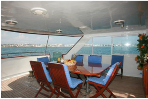
Aft deck View 1