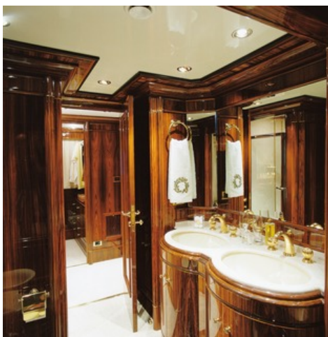
En suite facilities