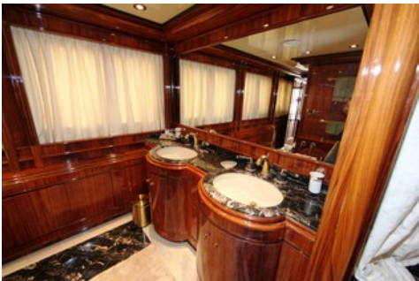
En suite facilities