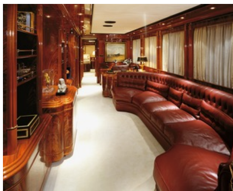
Study Area in Master Cabin