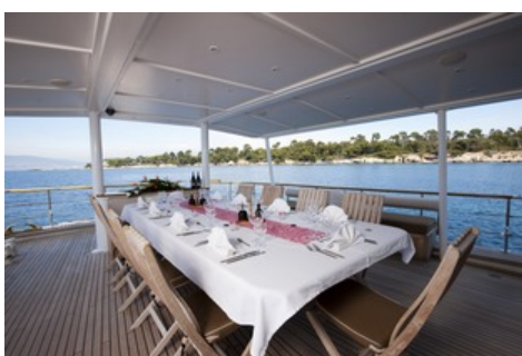
Main aft deck