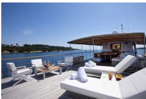
upper deck - sunbathing