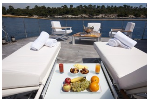
upper deck - sunbathing