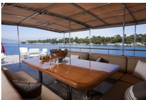
upper deck - capacity of 12 guests around this table