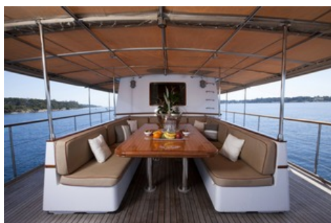
upper deck - capacity of 12 guests around this table