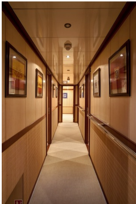
Cabins lower deck (VIP, 3 x double, 3 twins)