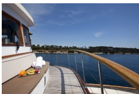
upper deck -sitting area