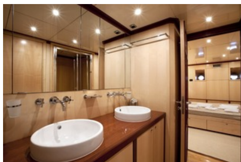
VIP ensuite facilities