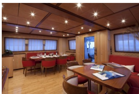
Inside dining area