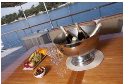
Clara One detail