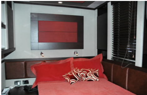
Double Guest Stateroom