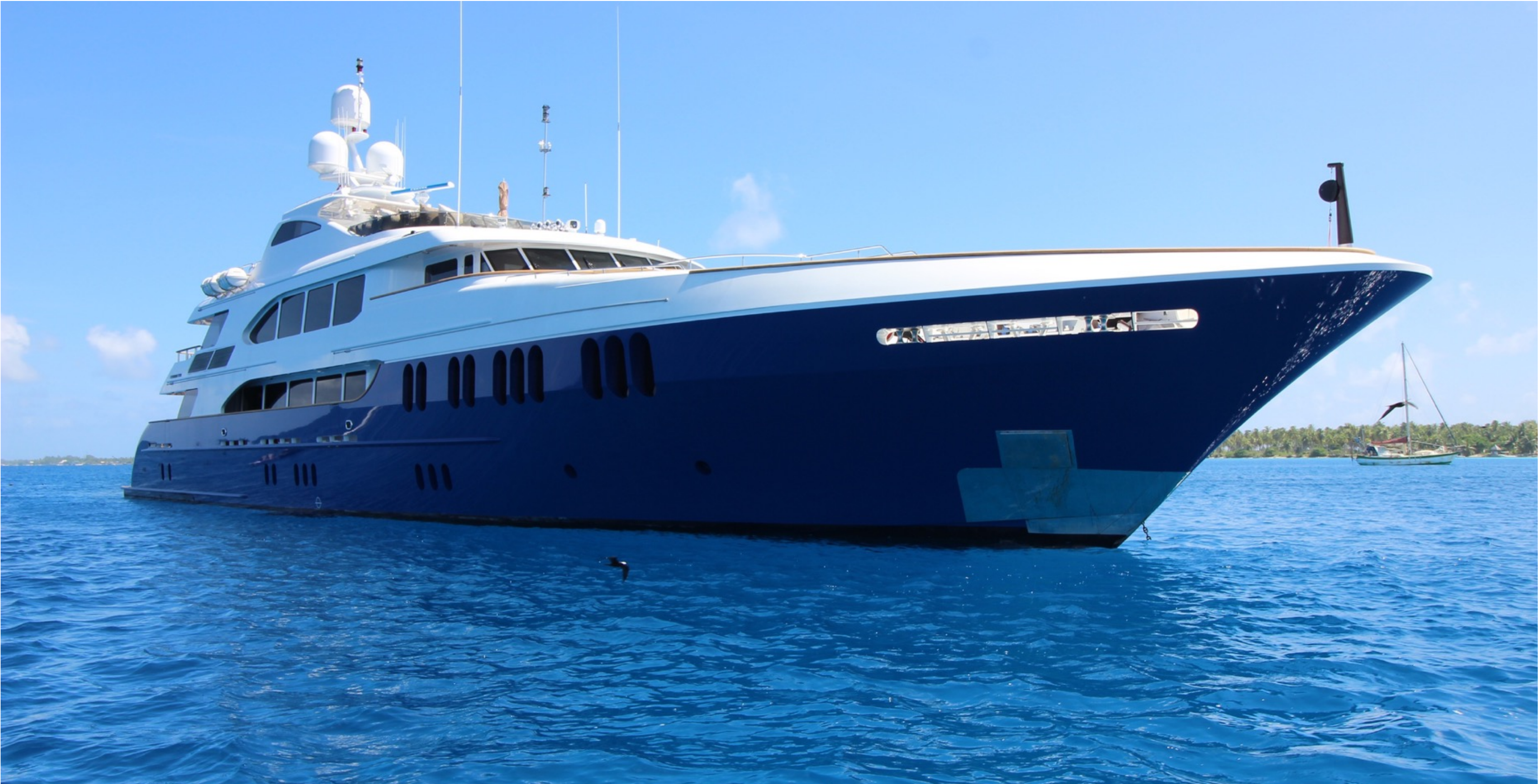
LA DEA II