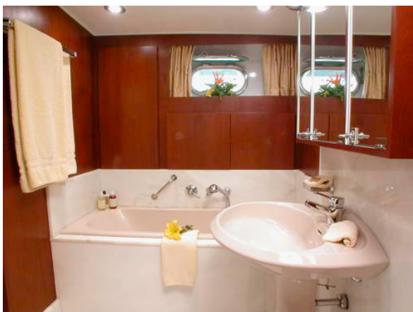
Guest Cabin Bathroom