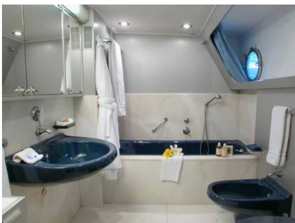
Main Cabin Bathroom