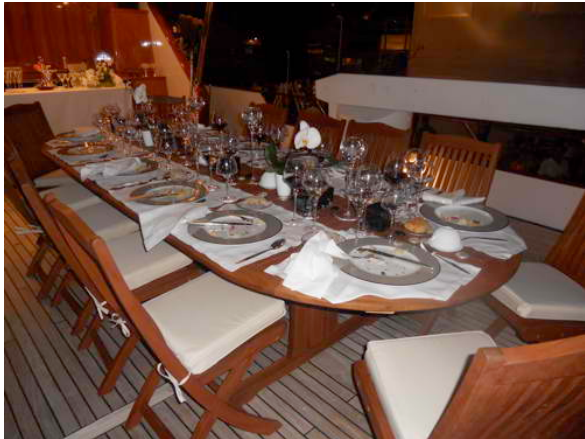
Sundeck extra dining