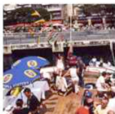
Corporate event charter 1