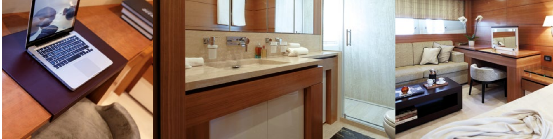
This VIP cabin at lower deck offers almost the same comfort than the master cabin, a perfect accommodation for special Guests.