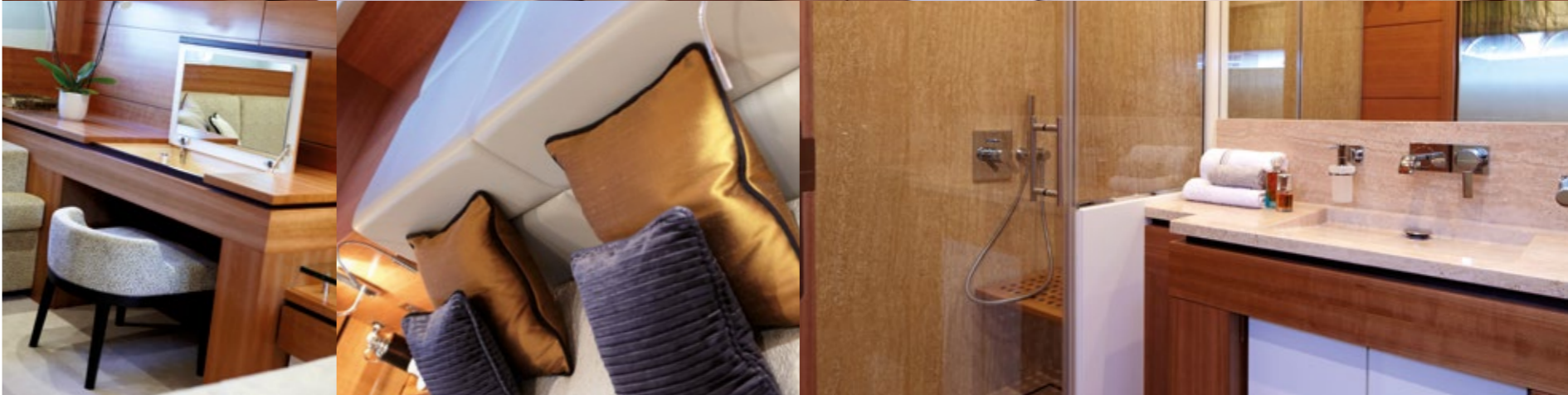
The elegant VIP cabin is located on the main deck forward area, and benefits from a large panoramic view, with an en-suite bathroom.