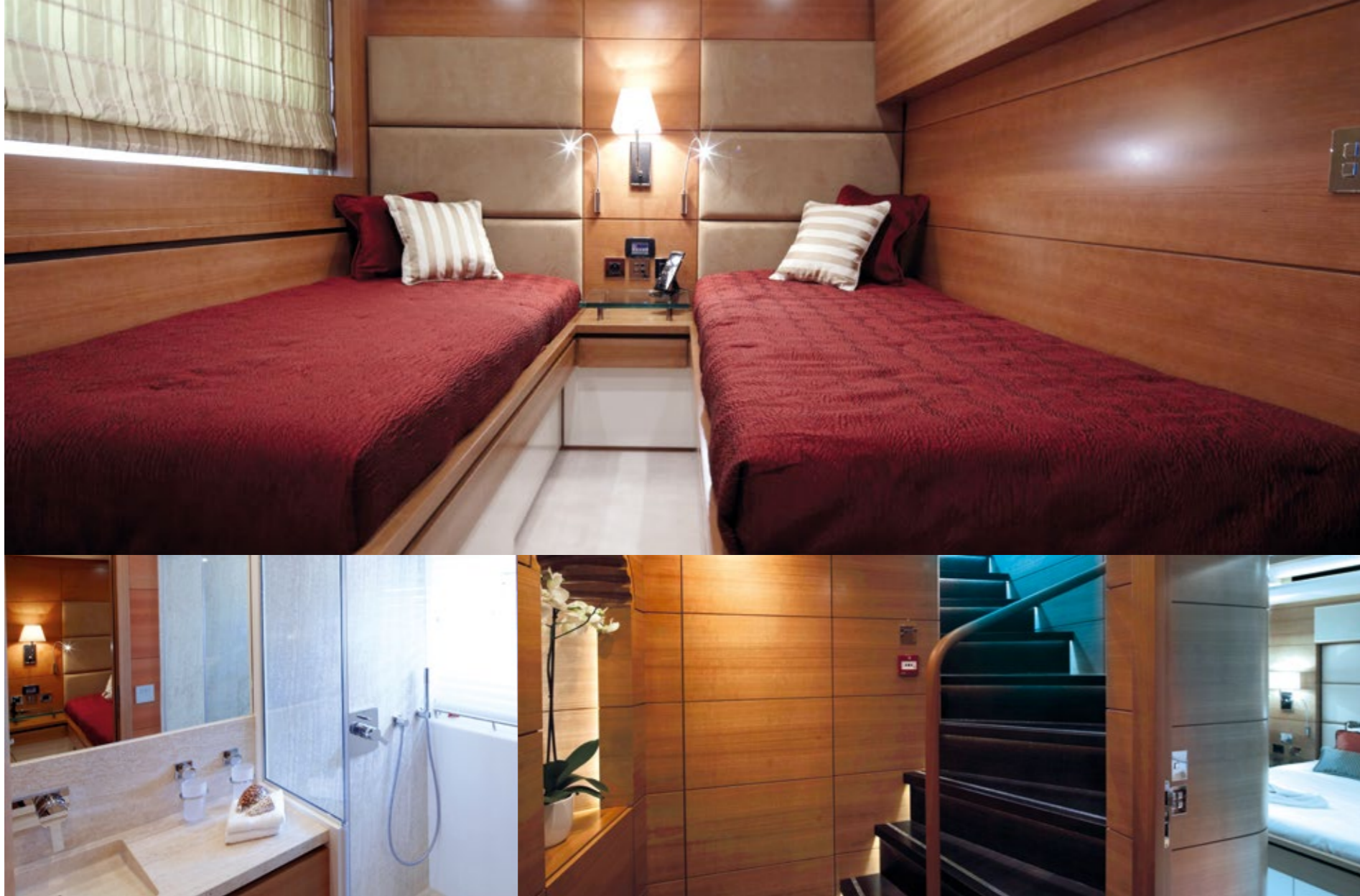
Finally the lower deck is completed with a twin Guest cabin which also includes a Pullman bed and its own bathroom.